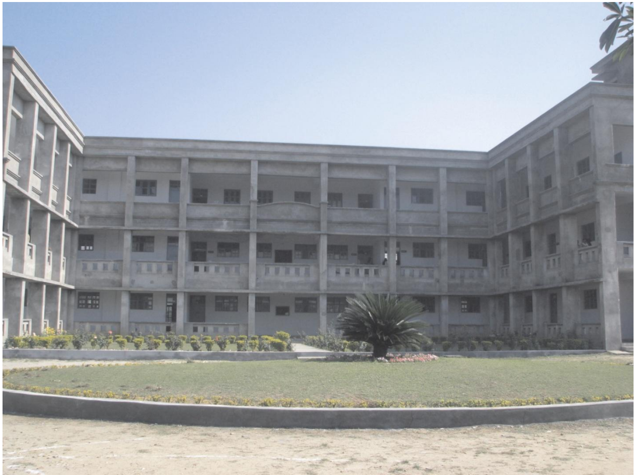
North Polytechnic, Purkhoo Camp, Domana Jammu