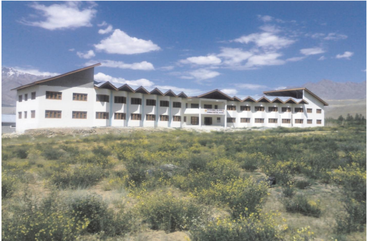
Govt. Polytechnic, Kargil