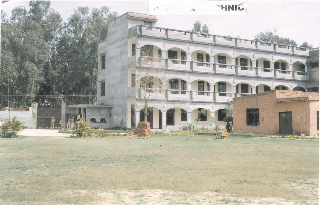
NITS Polytechnic, Indira Nagar, Miransahib, Jammu.