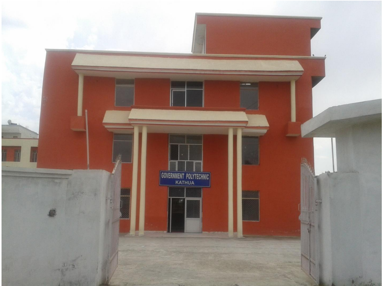
Govt. Polytechnic, Kathua