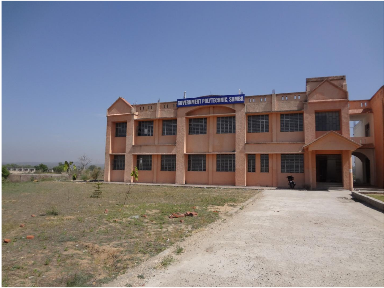
Govt. Polytechnic, Samba