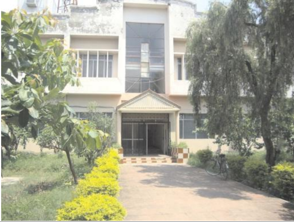
Govt. Polytechnic Bikram Chowk Jammu