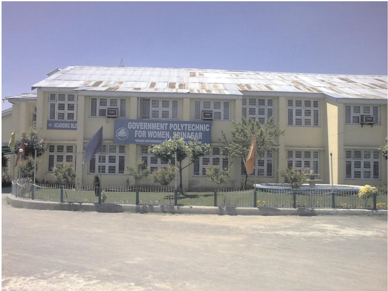
Govt. Polytechnic for Women, Bemina, Srinagar