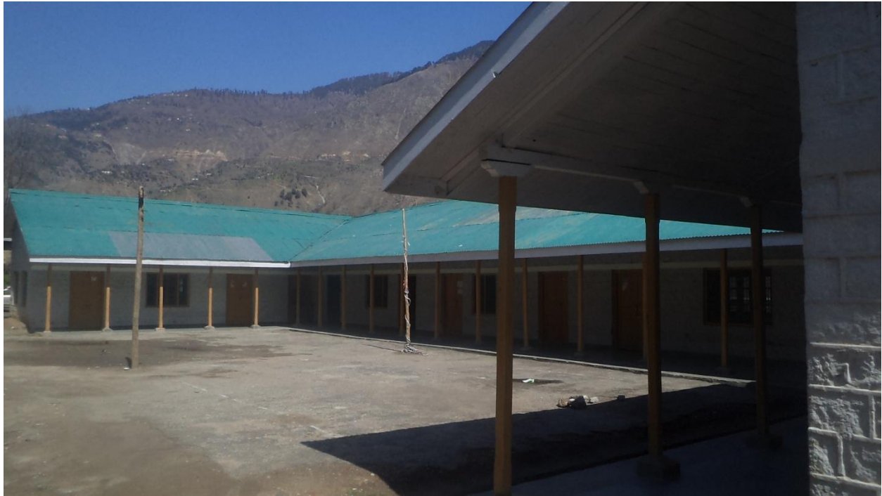
Govt. Polytechnic, Doda