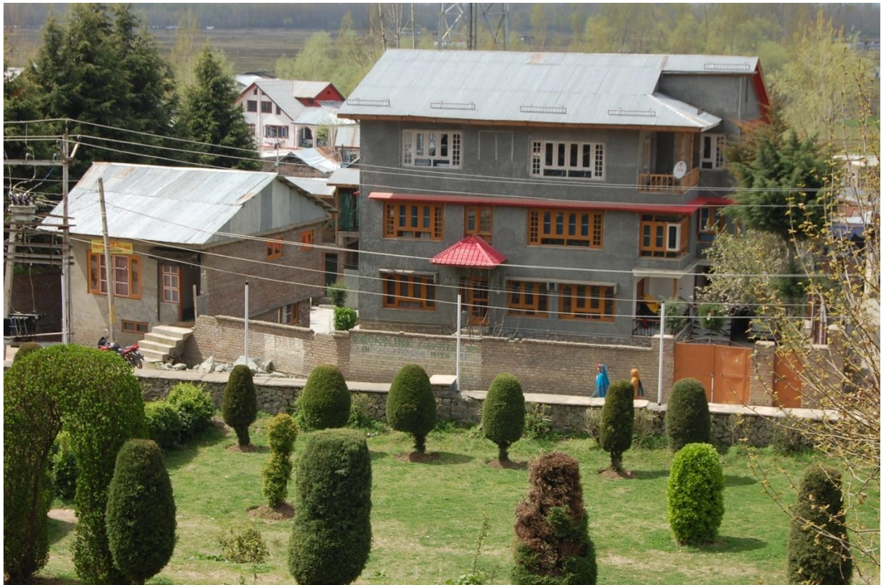
Govt. Polytechnic, Bandipora