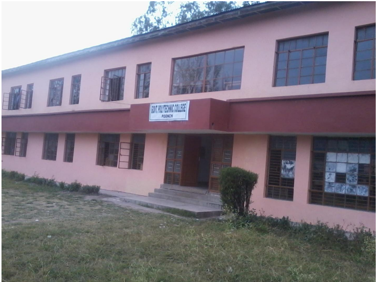
Govt. Polytechnic, Poonch