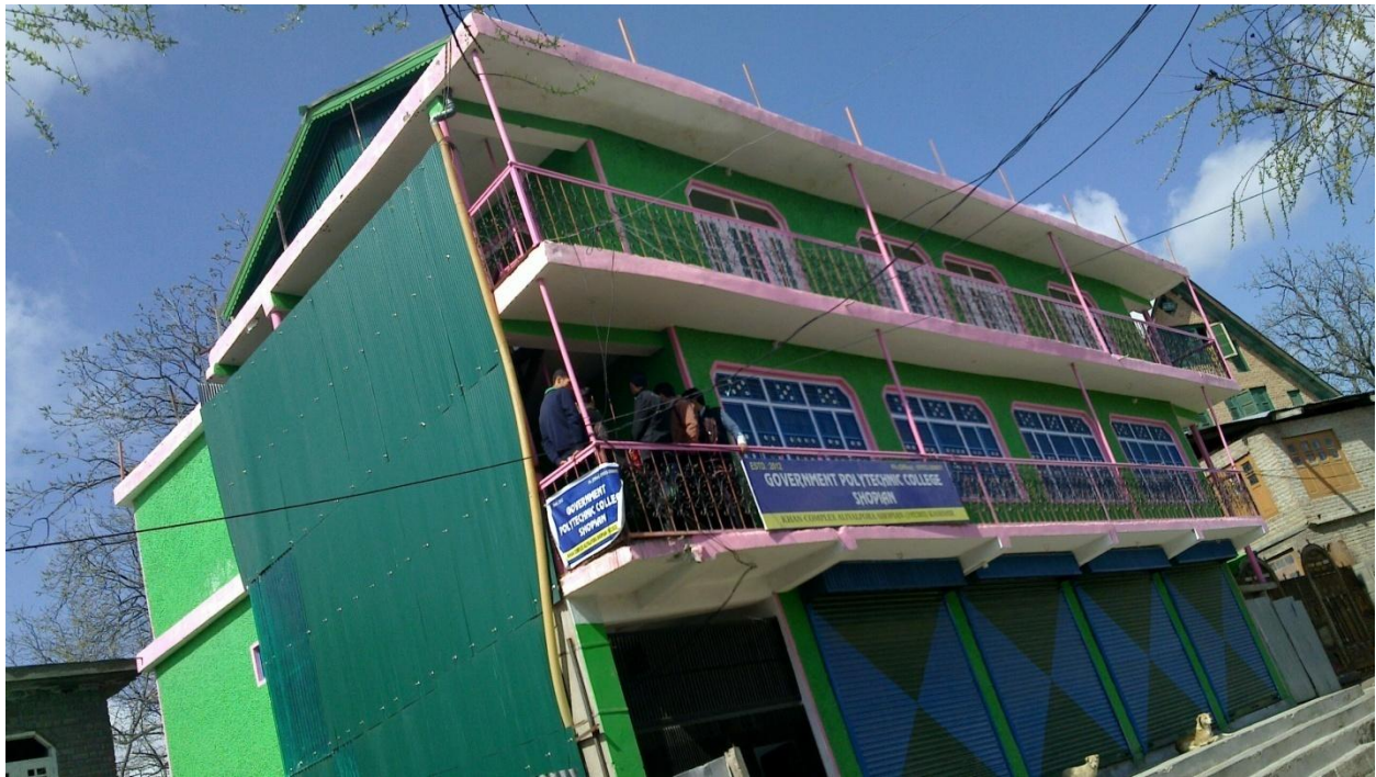
Govt. Polytechnic, Shopian