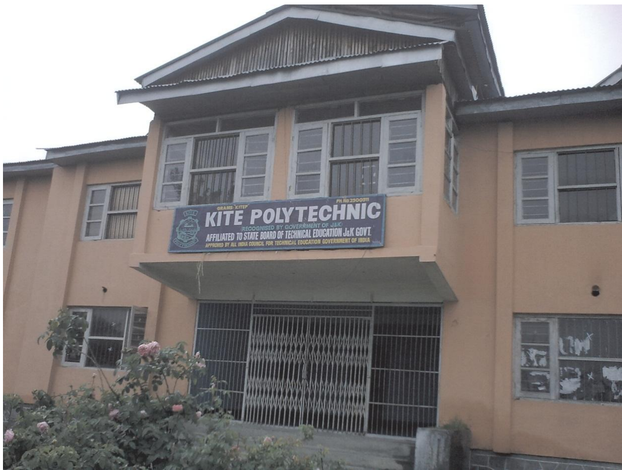
Kite Polytechnic, Wavoosa Rangreth, Kashmir.