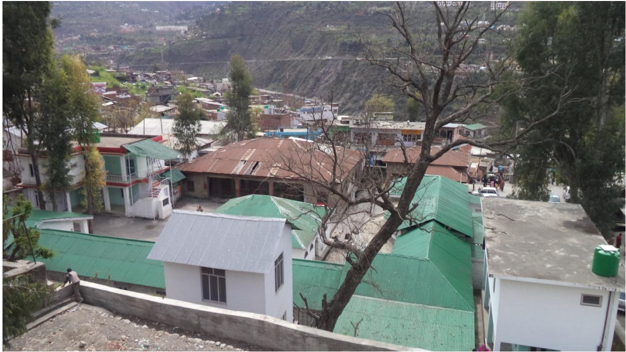
Govt. Polytechnic, Ramban