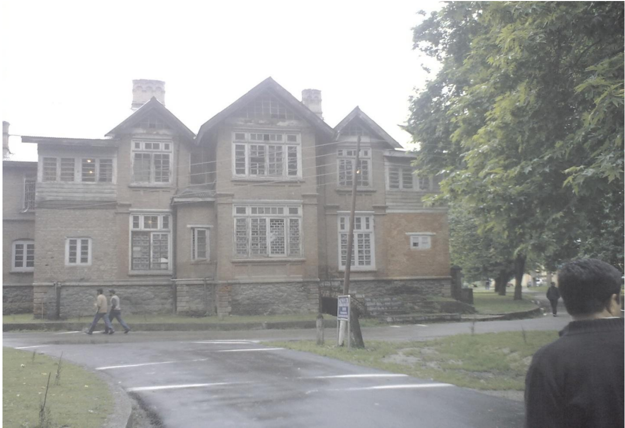
Kashmir Govt. Polytechnic Gogji Bagh, Srinagar