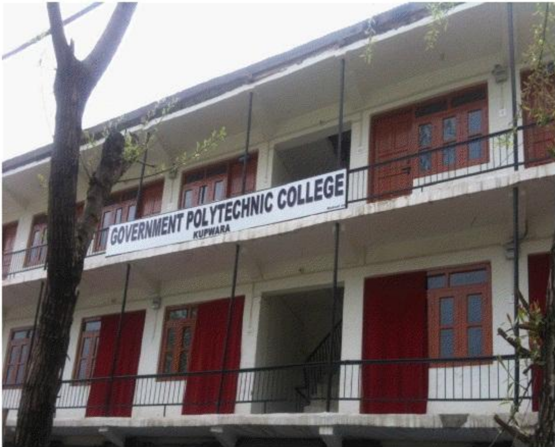
Govt. Polytechnic, Kupwara