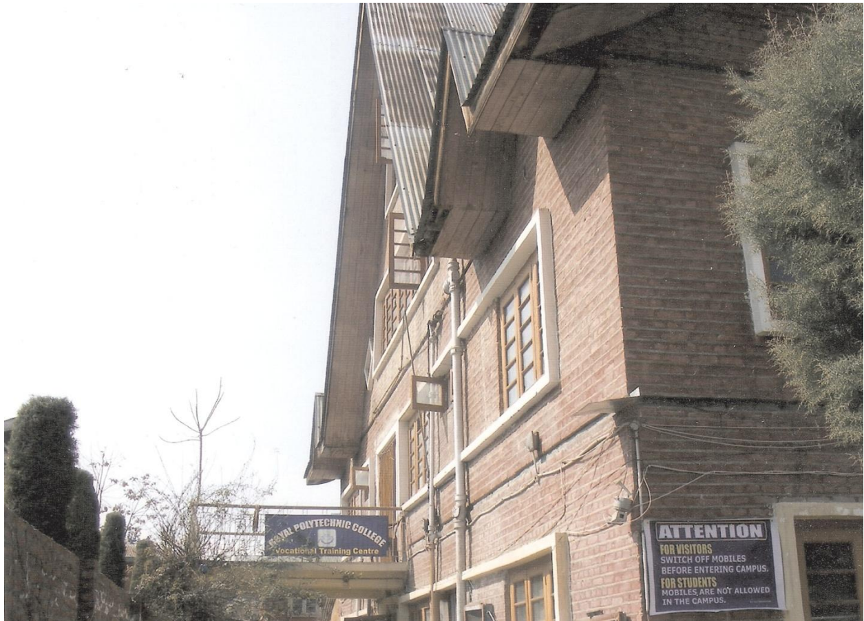
Royal Polytechnic, Behind Amar Singh College, Gogji Bagh, Srinagar.