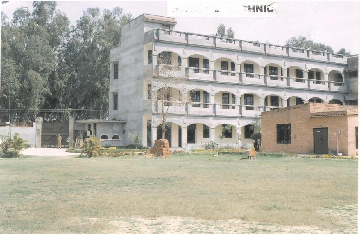
IECS, Purkhoo Camp, Domana Jammu