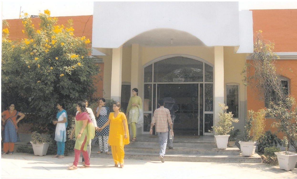
Kalamkari Vocational Oriented Woman's Polytechnic Upper Poloura, Jammu