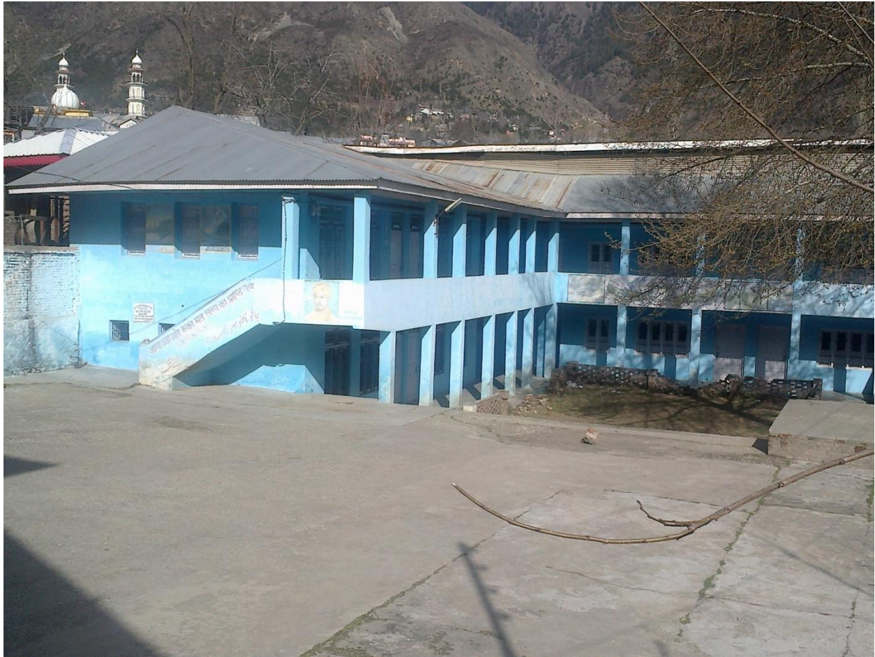
Govt. Polytechnic, Kishtwar