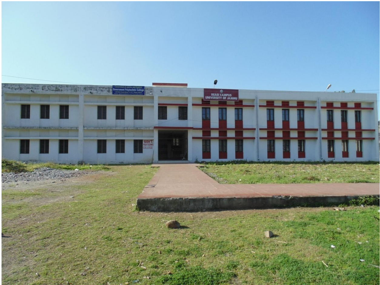
Govt. Polytechnic, Reasi