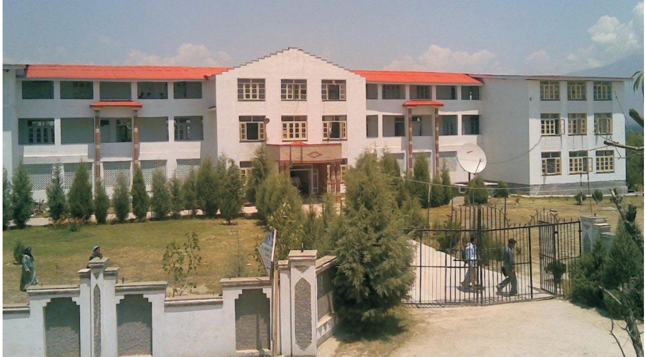
S.S.M. Polytechnic, Parihaspora Pattan, Kashmir.