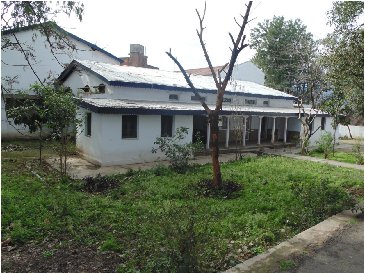
Govt. Polytechnic, Udhampur